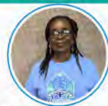
Senior Program Assistant