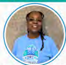
Assistant Site Coordinator