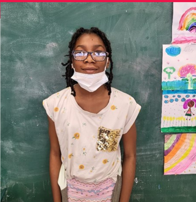
Community Services Foundation