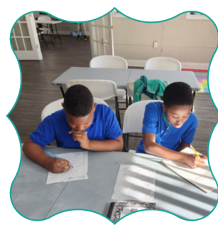
Learning Lab focused on Women's History & Theater in March