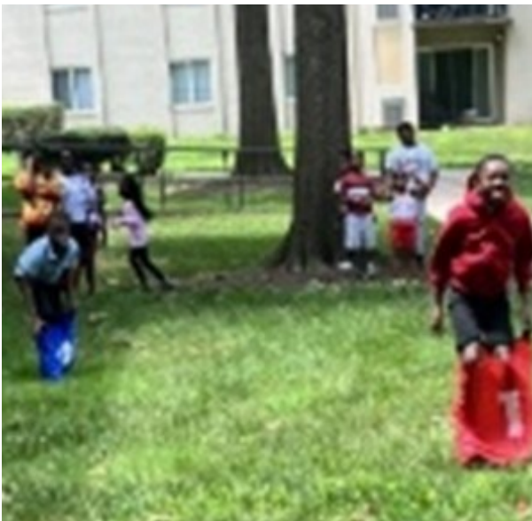
Community Services Foundation

https://www.princegeorgescountymd.gov/3472/COVID-19-Testing