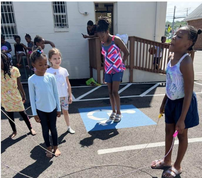
Community Services Foundation

https://www.princegeorgescountymd.gov/3472/COVID-19-Testing